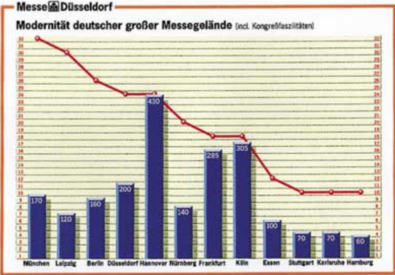
Table 1 - Comparison of emotions motivating behaviors ( this is only an example – do not use this table for any other purpose )